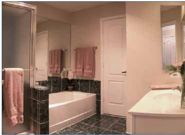
Gorgeous Full Bath