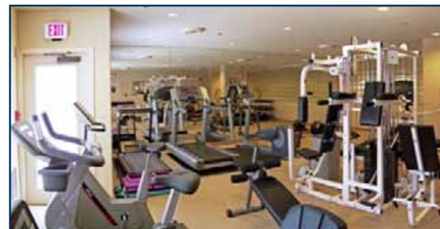
Fitness Room in Complex