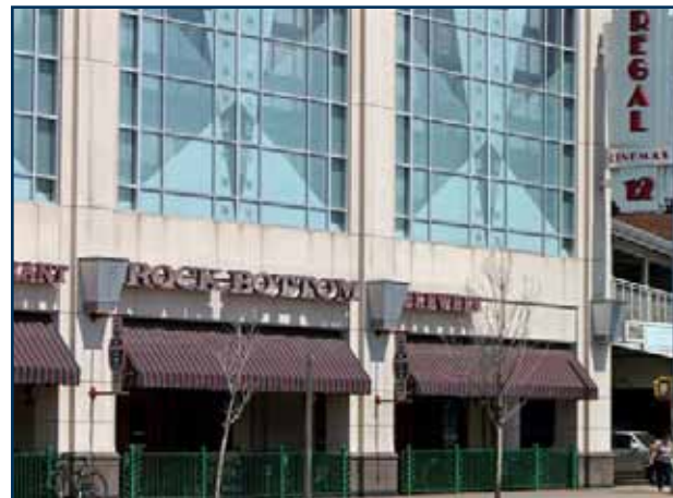
Walk to Cafes & Restaurants