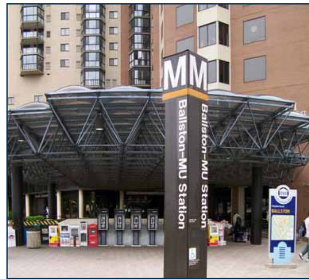
One Block to Ballston Metro!!