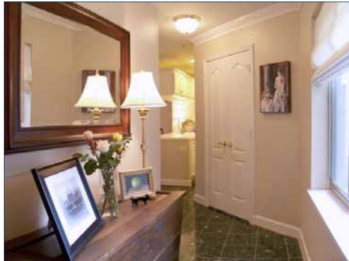
Gracious Entry Foyer