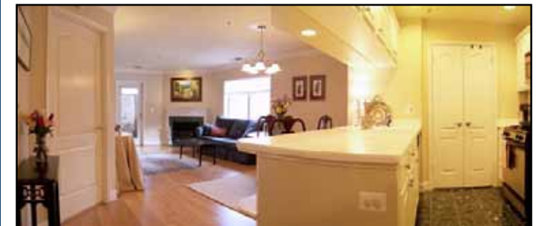
Incredible Open Floorplan!

www.mceneaney.com 1320 Old Chain Bridge Road McLean, Virginia 22101 703-790-9090 fax 703-734-9460