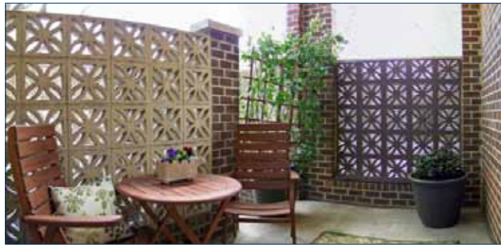
Private Terrace Great for Entertaining