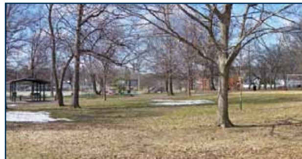
WALK to Quincy Park