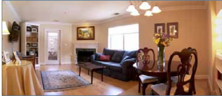
Welcoming Living Room with Gas Fireplace