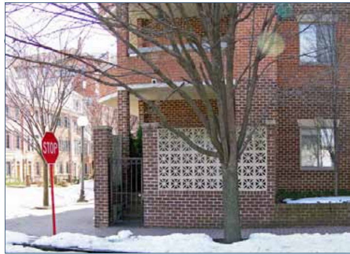
Unit has its Own Private Exit

Dining Room With Custom-Made Shelving Contemporary Pergo Flooring