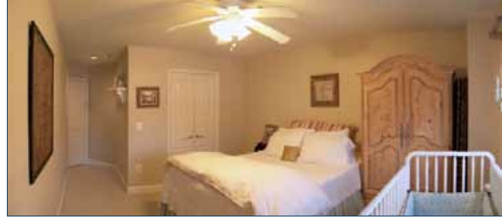
Private Master Bedroom Retreat