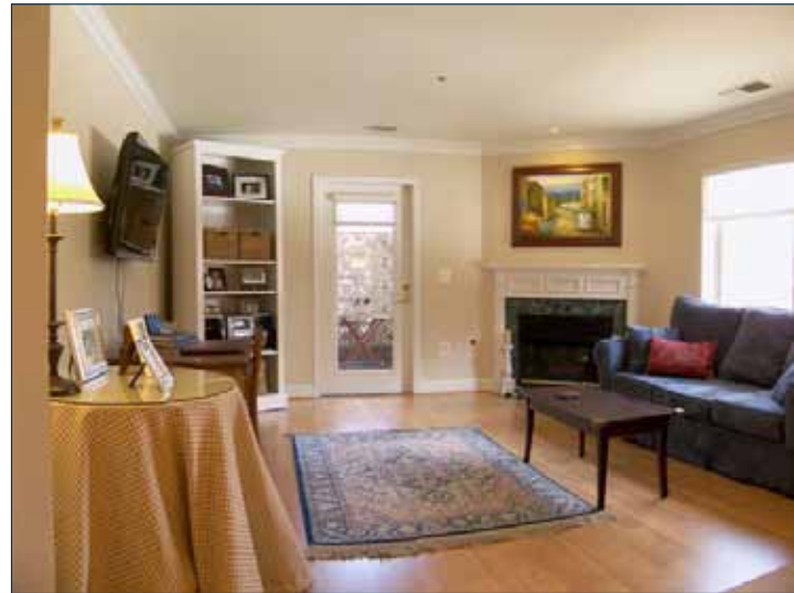
Living Room Walks Out to Lovely Terrace