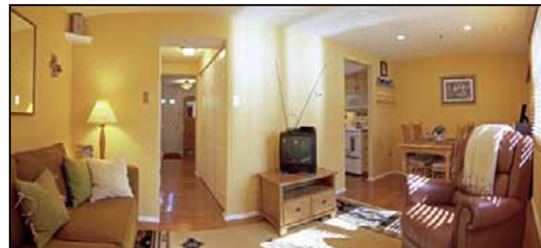
Cozy Family Room Retreat Right off of Kitchen