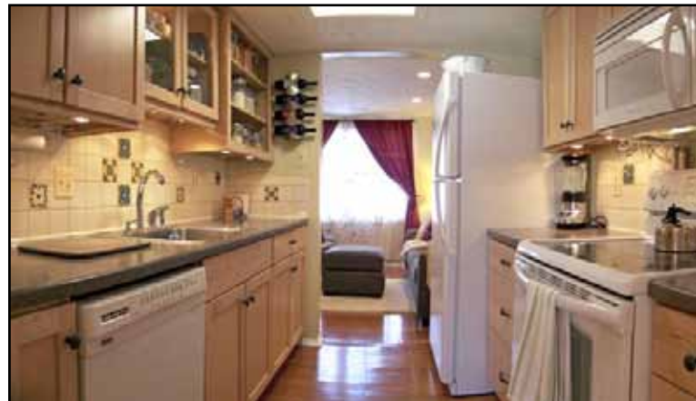
Stunning Renovated Gourmet Kitchen