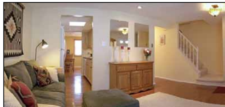
Elegant Living Room