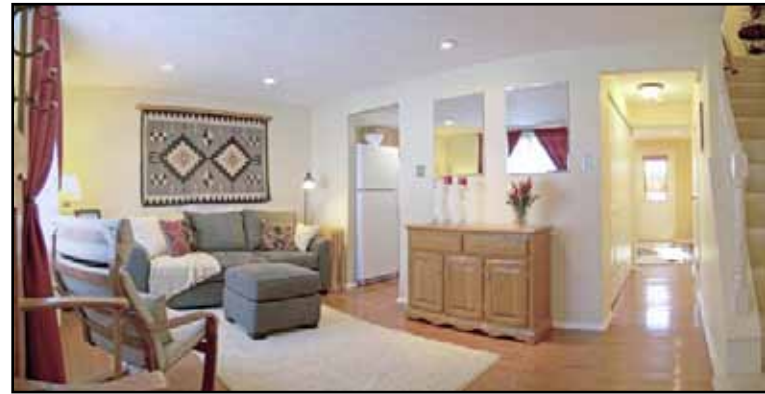
Great First Impression!