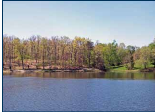
Lake Fairfax Nearby!