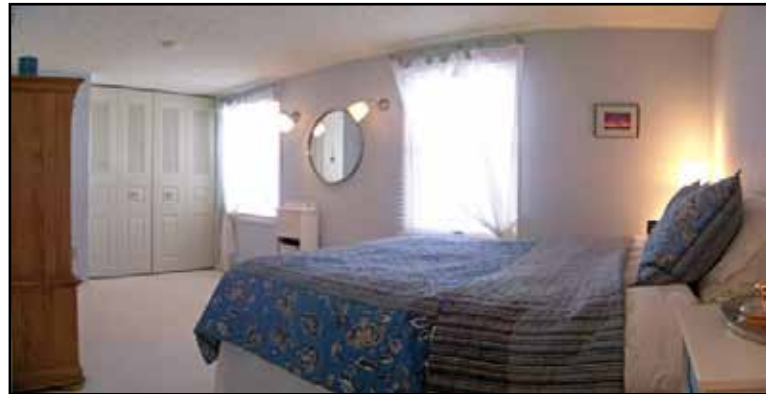
Master Suite with Private Master Bath