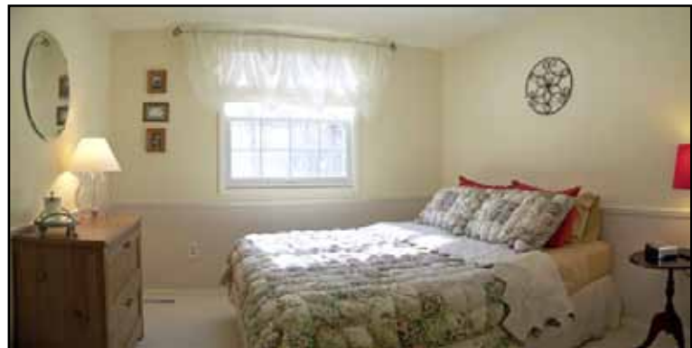
Both Bedrooms 2 & 3 Back to Treed Privacy!