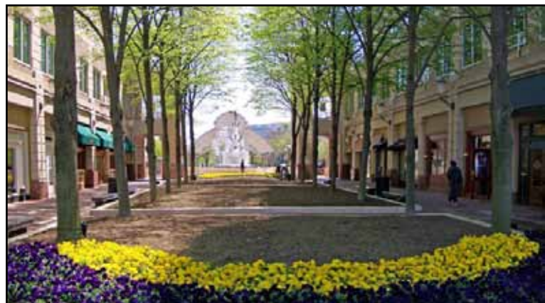
Minutes to Popular Reston Town Center