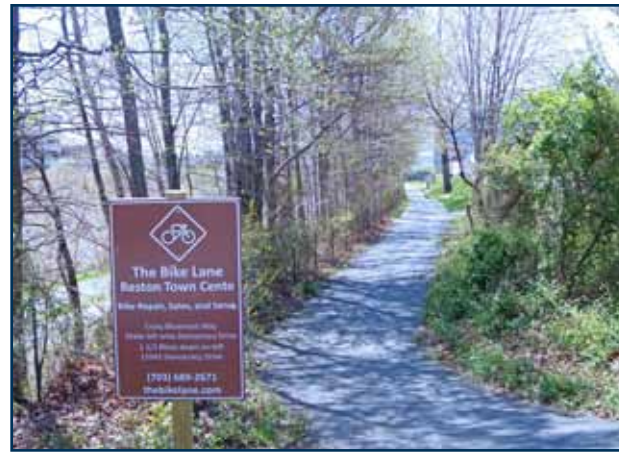
Enjoy 50 Miles of Reston Bike Trails!

Reston Golf Course, Worldgate Athletic Club, Frying Pan Park Equestrian, 17 Outdoor Pools, 49 Tennis Courts, 22 Multi-Purpose Basketball and Volleyball Courts, 25 Baseball and Soccer Fields, 2 Ice Skating Rinks, 21 Picnic Areas, 4 Beautiful Lakes, Dog Parks, and more than 50 miles of paved pathways for walking, running, cycling, and jogging!!