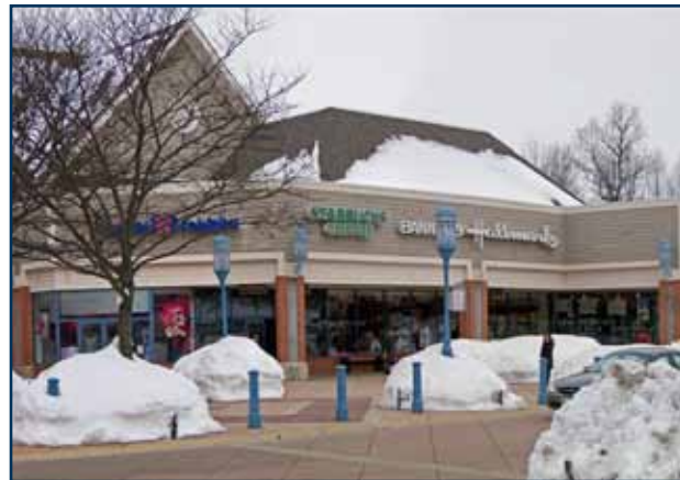
Walk the Path to North Point Shopping Center!