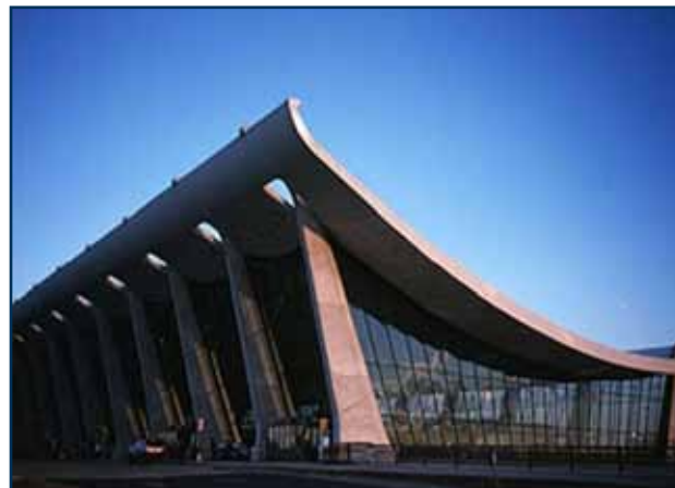
Dulles Airport only 7.7 Miles Away!