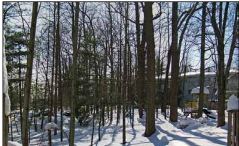
Backs to Woods!!!